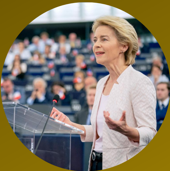
Ursula von der Leyen