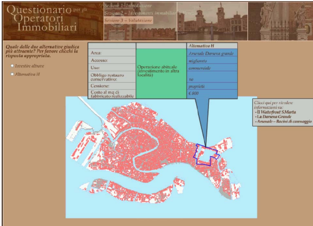
Figure A.2: Example of Choice between a Venice and a non-Venice alternative