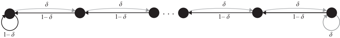
Figure 2: The unbalanced line, which demonstrates that a network may not converge to truth even if every agent's incoming trust is bounded. Agents are numbered from left to right.

One thing that goes wrong in this example is that the central agent receives an high amount of trust relative to the amount given back to others, making him unduly influential. However, this is not the only obstruction to convergence to true beliefs. There are examples in which the trust coming into any node is bounded relative to the trust going out, and there is still an extremely influential agent who can keep society's beliefs away from the true state. This shows how indirect weight can matter.