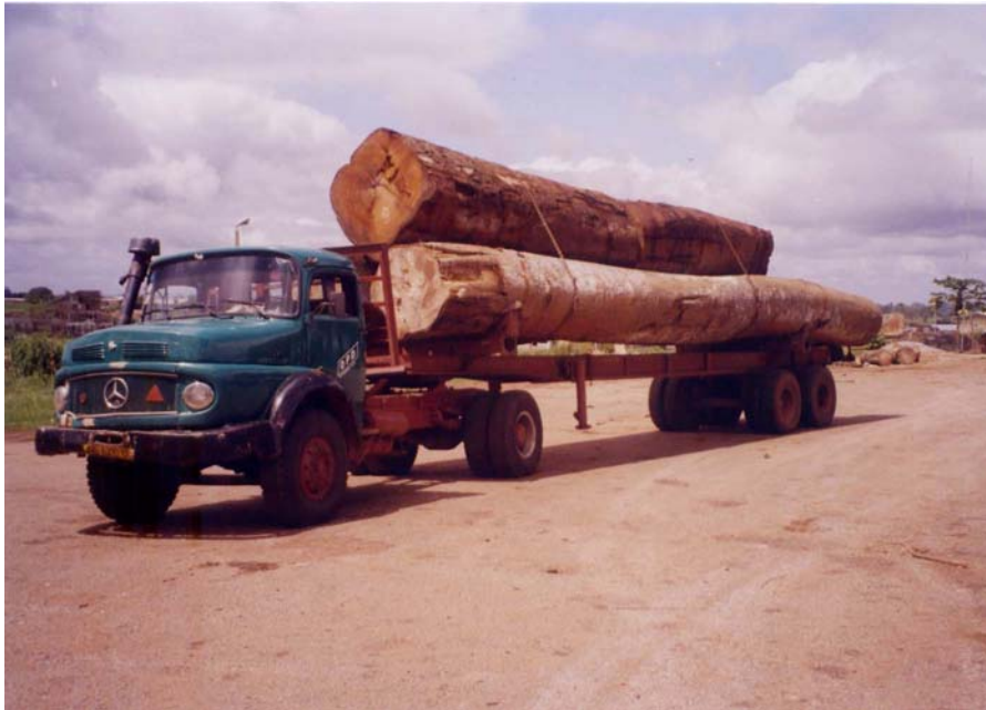
Figure 4: A loaded timber truck

local environment as well as infrastructure (artery roads, bridges and culverts). In a triangulation with a Ranger of a forest reserve in the region, it was confirmed that in terms of real destruction of the environment, it is the formal timber firms which are causing the havoc because of their use of heavy equipment. He however emphasised that unlike the chainsaw operators, the operations of these firms are comparatively easier to monitor, and corrective measures can easily be taken.