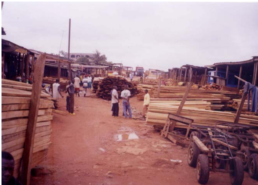
Figure 3: A section of the Anloga Timber market in Kumasi

A typical local timber market comprise mainly of traders (or merchants) of sawn lumber and other wood products, master craftsmen or artisans (mainly carpenters and other wood fabricators) and their apprentices as well as small and medium scale sawn millers. Service providers in the market include porters, delivery vans and truck operators, cooked food sellers and traders in hardware (nails, industrial glue, etc) required by the artisans for their work.