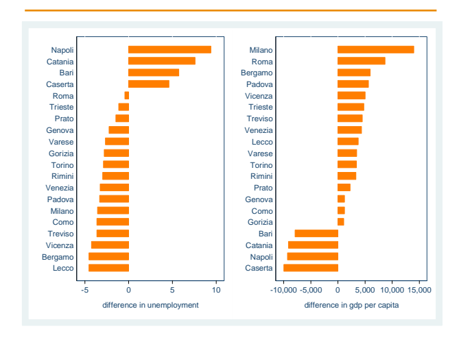
Figure 3: Differences with respect to national level